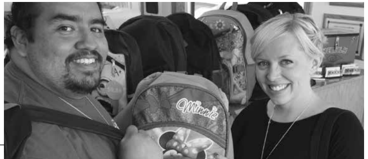
Cars-N-Credit Backpack Donation to Ready Set School

Ready Set School supports children receiving basic and necessary clothing as well as supplies to start a successful school year. One hundred percent of funds raised are given to Winona County children in the form of vouchers to be spent at local retailers.